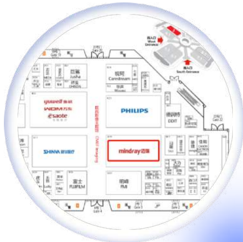
Schematic Diagram (Past CMEF Booth Map)